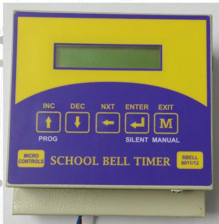
School Bell Timer