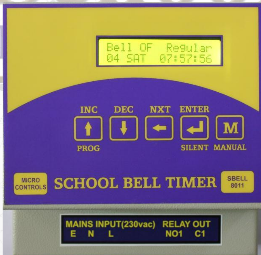
School Bell Timer